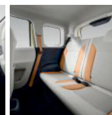
580L magic variable space