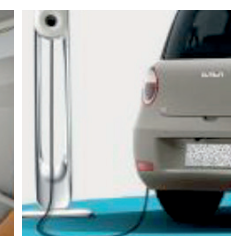
DC fast charging 35min