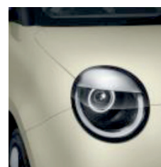
Cute round eyes and smiling face design